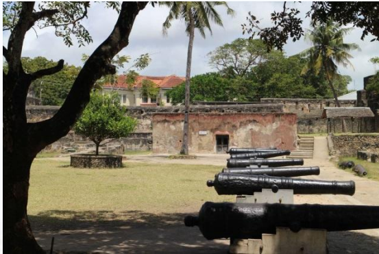
1. Fort Jesus