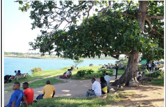
9. Mama Ngina Drive