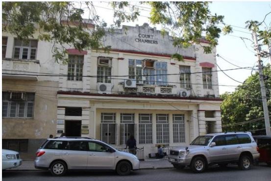
7. The Old Law Courts