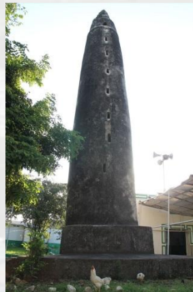
11. Mbaraki Pillar