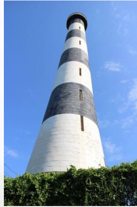
8. Old Watch Towers