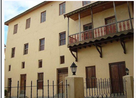
3. Leven House