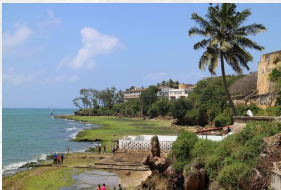
4. Portuguese Shipwreck