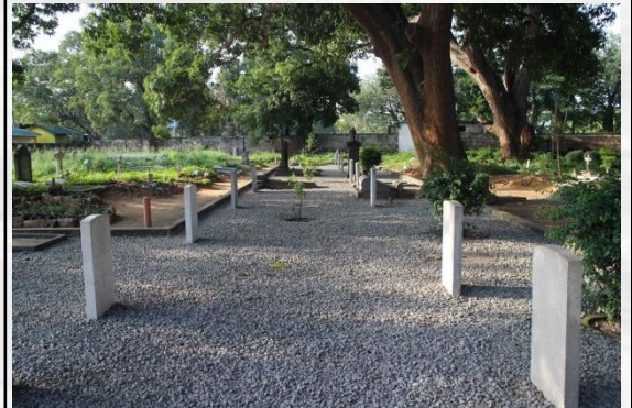
12. Mbaraki War Cemetery