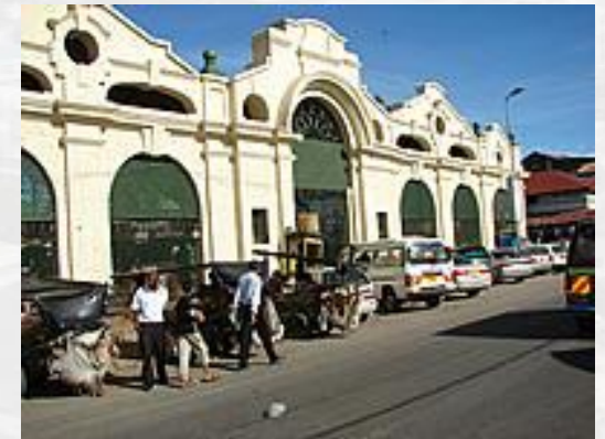
6. Mackinnon Market