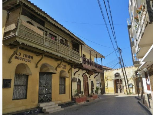
2. Mombasa Old Town